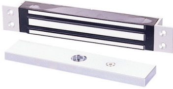
74-AM300 / 74-M400