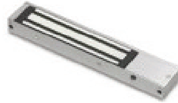
74-S300 / 74-S400 / 74-S500